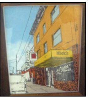
The "HENKE FAMILY" had many happy moments over the years and still to today at Nick's Restaurant