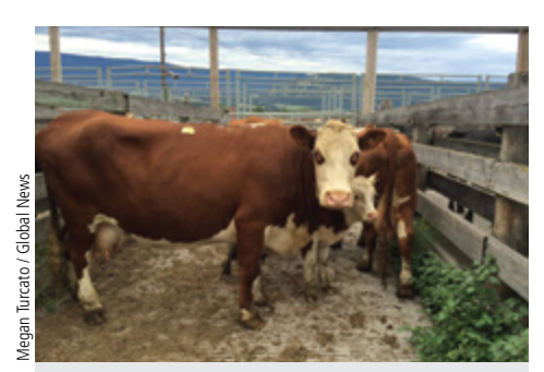
Valley Auction held its last cattle sale at the Spallumcheen auction house on Thursday.

SPALLUMCHEEN – After more than five decades of selling livestock in the north Okanagan, Valley Auction held its last cattle sale at the Spallumcheen auction house on Thursday.