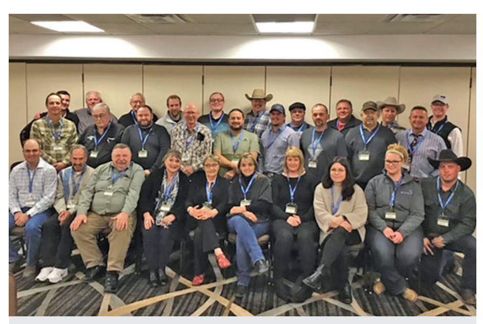
Alberta Auctions 102 & 201, February 1, 2018 at Leduc