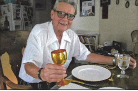
CELEBRATE LIFE - GET UP AND GO! YOUR FUTURE HAS MANY TREASURES—START NOW—OK— ENJOY THE THRILL—I HAVE!